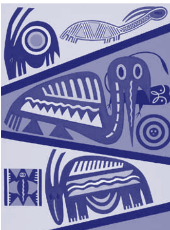
The St. John's College Mitchell Gallery will host Lois Mailou Jones: A Life in Vibrant Color, January 10th through February 18th, 2012.

The show, "Artists' Favorites", is scheduled to open on March 10, 2012. All Anne Arundel County residents are eligible to enter this juried exhibit. Submissions are due to the Arts Council by February 10th, 2012. Download a prospectus for the show at: www.annearundelartscouncil.org